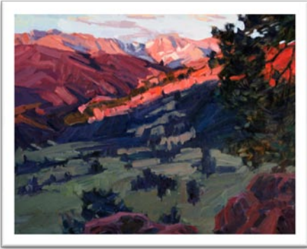
“Dawn at Beaver Meadows Overlook”

Women's Fine Art in Numerous Subjects & Mediums . . . Across the United States